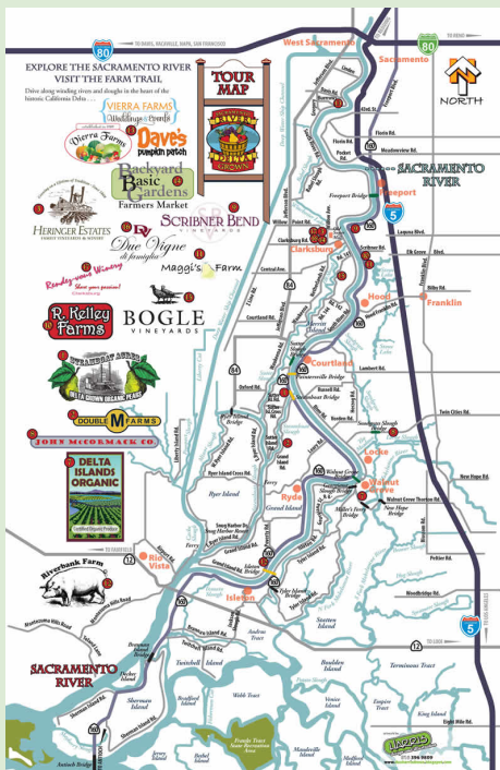
Sacramento River Delta Grown Agritourism Association Map