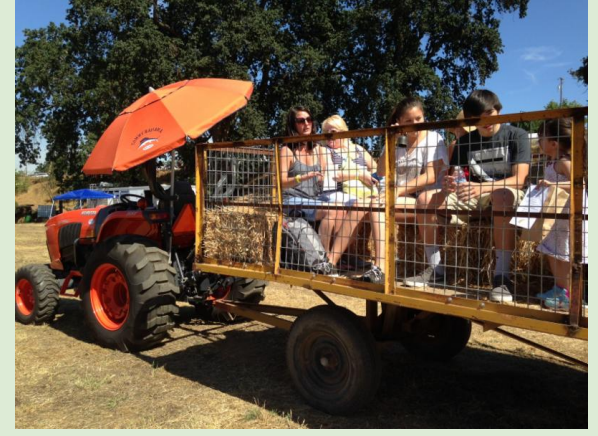
Hayride, Riverdance Farm, Livingston