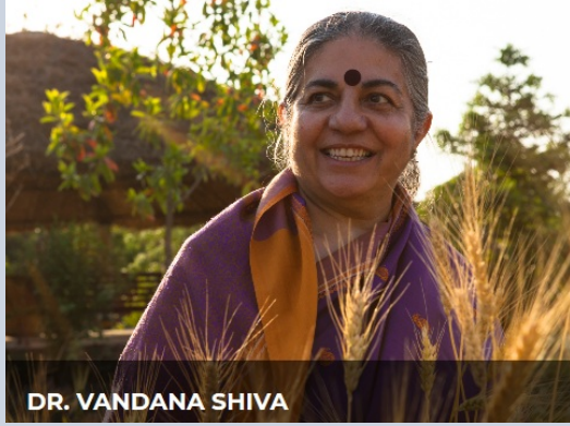
DR. VANDANA SHIVA