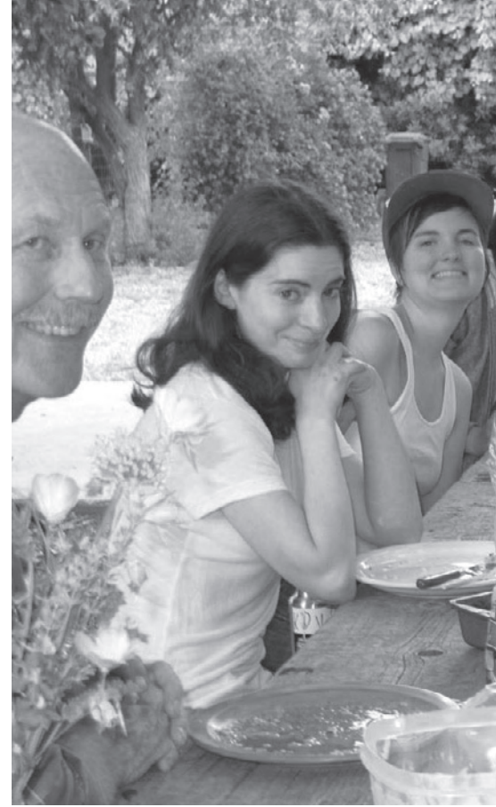
Local food potlucks at the UC Davis Student Farm were part of Keepin' It Real Food Week!