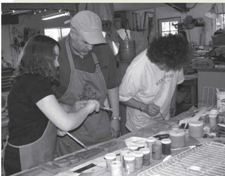
Making tiles for sustainability pillar.