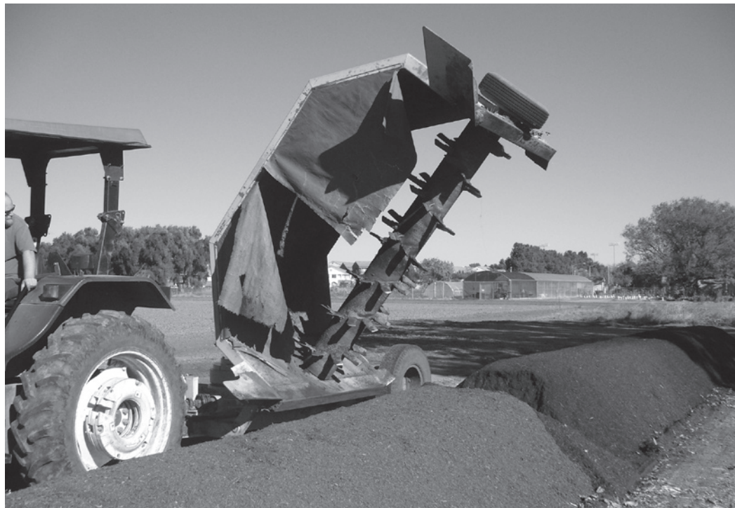
Compost, seen here at the UC Davis Student Farm, is a useful way of adding organic matter to soil. Organic matter provides food for all soil organisms, including bacterial- and fungal-feeding nematodes, which are integral components of healthy soils.

At the UC Davis Student Farm, we tested ways to maintain healthy soil communities found in prairies and other natural systems in our crop rotations today. Cover crops are a useful tool for farmers. Grown before cash crops, cover crops add nitrogen and organic matter to the soil. We grew three combinations of cover crops providing varying levels of carbon and nitrogen to soils and biological communities. We learned that growing a cover crop increases the number of beneficial nematodes by up to 70 percent. Cover crop mixtures containing legumes increased the activity of nematode communities associated with nitrogen cycling, indicating enriched soils with sufficient resources and active decomposition. Release of nitrogen by active biological communities under cover crops may increase crop productivity and increase profits to farmers.