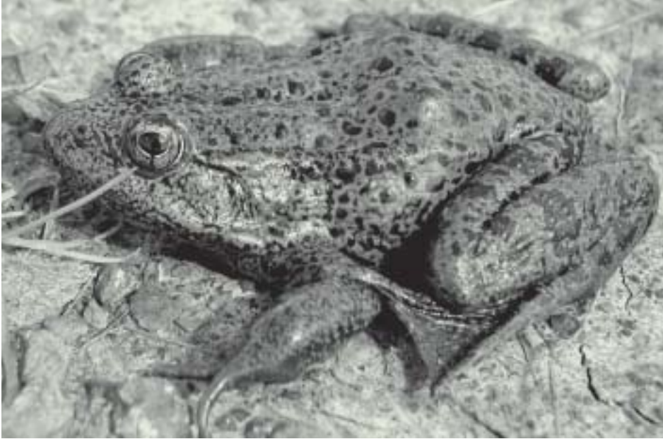
California red-legged frog (threatened).

California native plant complexes have yet to be explored as determinants of amphibian assemblages.