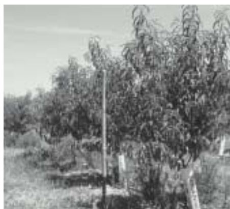
Peach trees in replant disorder research study.

This phase-out has significant implications for California agriculture, as methyl bromide is widely used as a pesticide for the