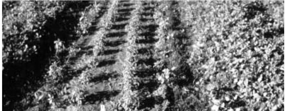
Snapdragon and godetsia seedlings planted in fields solarized with tarps or incorporated with fresh broccoli for weed control.

The coastal regions of California represent a highly valued and productive component of California's ornamental industry, but the productivity of these regions is seriously threatened by the pending loss of methyl bromide. Some of the alternatives that have been proposed for strawberries [e.g., chloropicrin plus 1,3-D (Telone)] probably will not be suitable for ornamental production. This is because production of these specialty crops tends to be dispersed on many small parcels of land near homes and business, and cannot easily accommodate the ever-increasing buffer zone requirements. The goal of this project was to research the