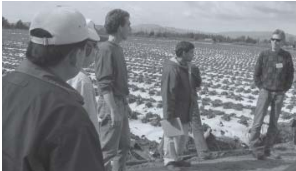
Short course participants toured Coke Farms in San Juan Bautista.