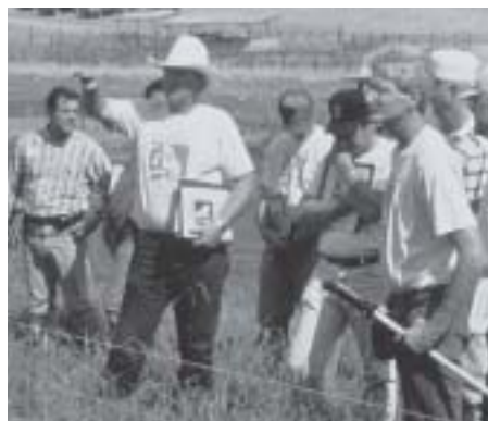
Cooperative Extension programs statewide are at risk.