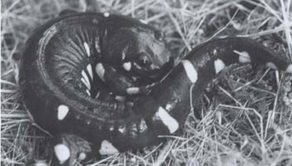
California tiger salamander (endangered in Santa Barbara and Sonoma counties).

vae often are awkward and lack effective defensive or escape mechanisms; thus amphibians may require breeding habitat that affords temporal or spatial isolation from predators. A key problem arises in that the aquarium trade includes several species of introduced, exotic fish, amphibians, and reptiles that may be released into the wild, inadvertently dispersing parasites and pathogens that affect native amphibians. In light of their apparent great sensitivity, amphibians may serve as an early warning system for environmental degradation.