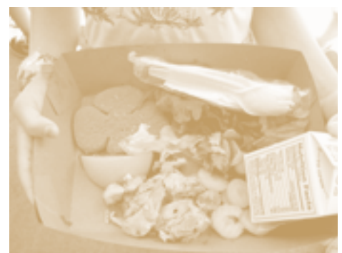
Salad bar lunch